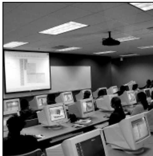
Computer Class in the Business and Technology Complex