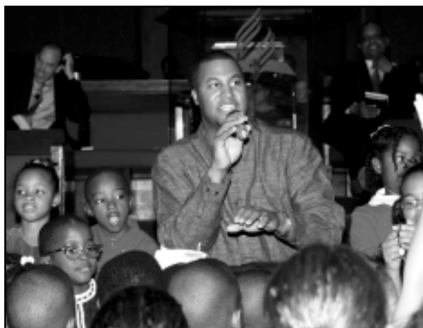
Telling the Children's Story