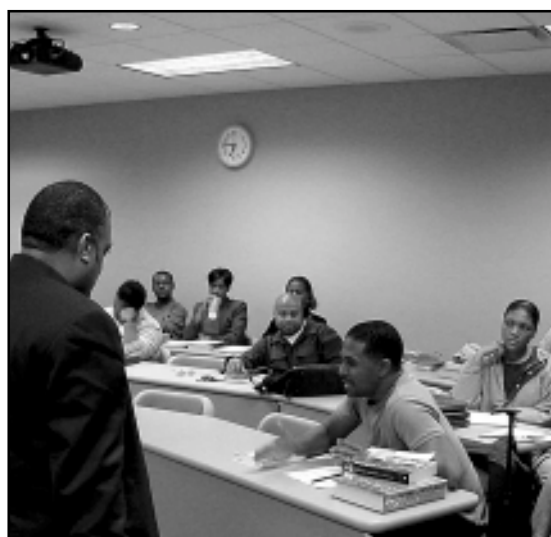
Classroom Scenes From the LEAP Program