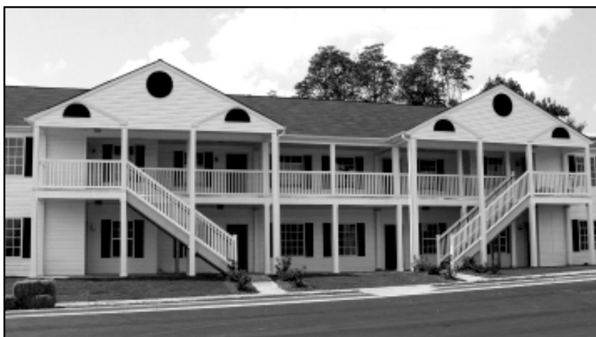
West Oaks Apartments

WOCG, the Oakwood College radio station, is located on Oakwood Road, less than one mile west of the central campus.