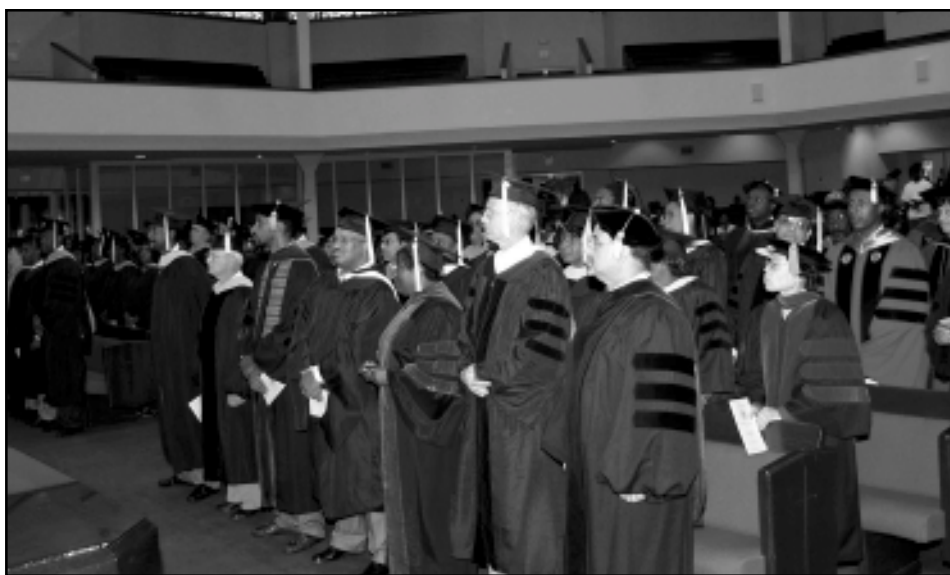
Faculty Members in Academic Regalia at Fall Convocation