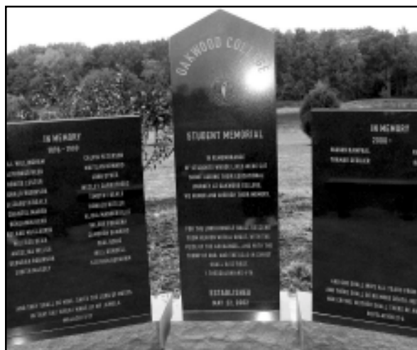
The Student Memorial