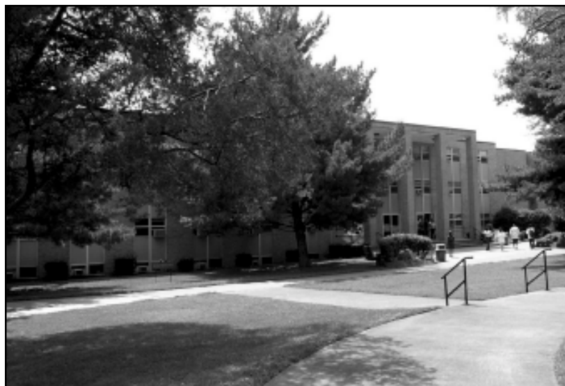
Bessie Carter Hall

The H. E. Ford Hall, completed in 1954, houses the Student Center, student leadership offices, and the Student Services Office.