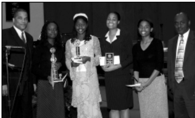
Students With Highest Grade Point Averages Are Honored