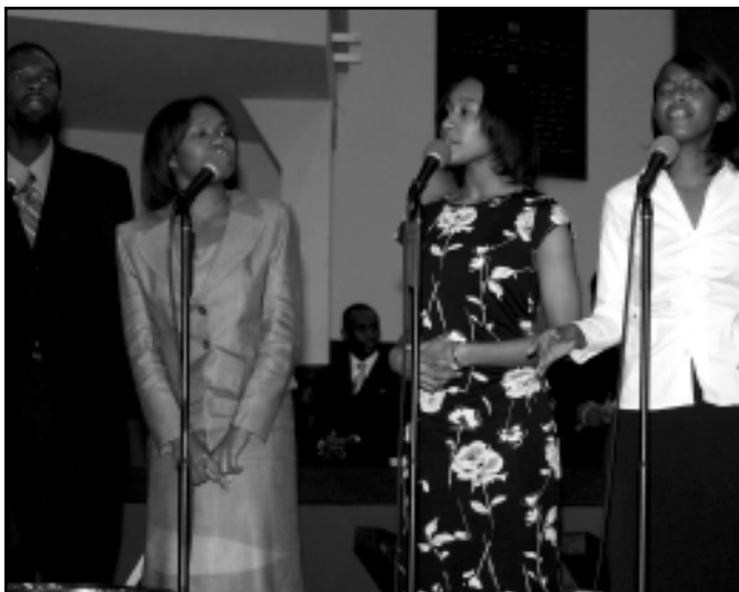
Oakwood Praise Group