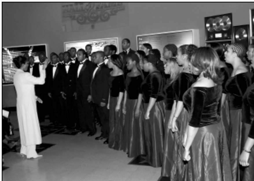
Aeolians at Alabama Music Hall of Fame

All academic awards are posted to the student's account after the last day to drop a course has occurred. For details regarding academic scholarships, see the Scholarship Handbook provided by the Enrollment Management Office. Students cannot receive refunds based on over awarding of institutional funds.