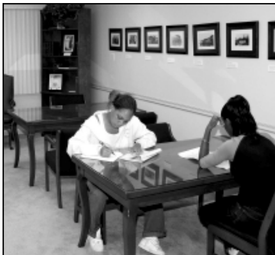
Studying in the Ellen G. White Estate Reading Room

This course will afford students the opportunity to do additional study in an area of interest under the direction of an advisor. Prerequisite: permission of the department chair.