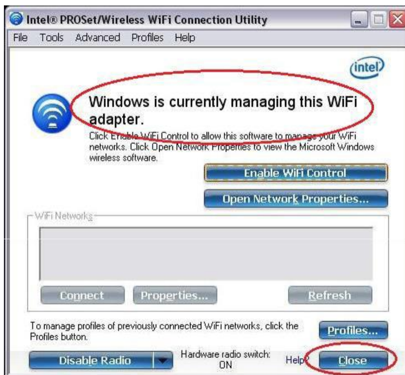
Figure 3 - Windows is currently managing this WiFi adapter