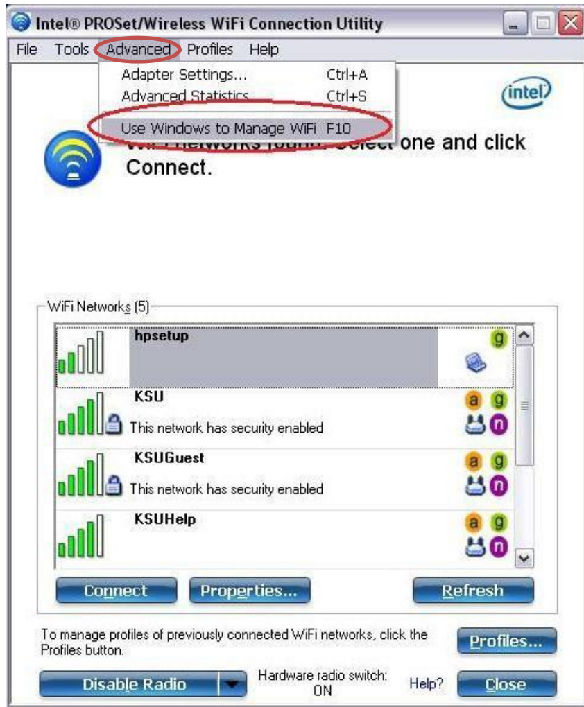
Figure 1 – Intel PROSet WiFi Connection Utility

3. Click on Advanced → Use Windows to Manage WiFi as shown below