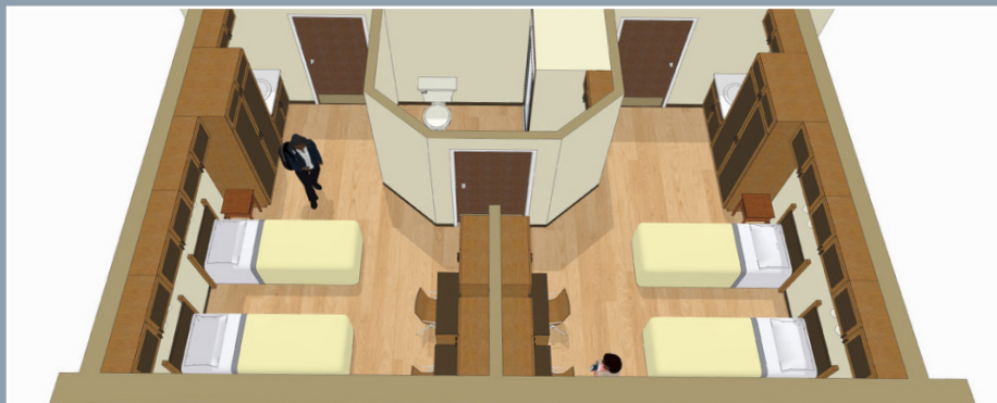
Fig. 2. Carter Hall Double Rm. Suite w' Shared Bath (Perspective View)