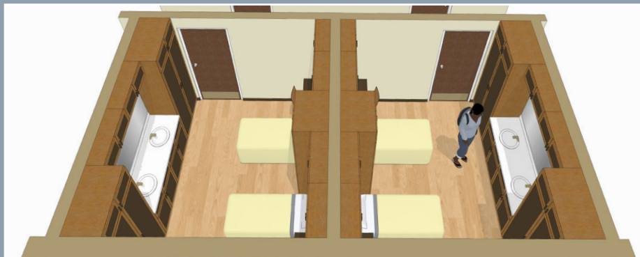
Fig. 3. Carter Hall Double Room w/o Bath (Perspective View)