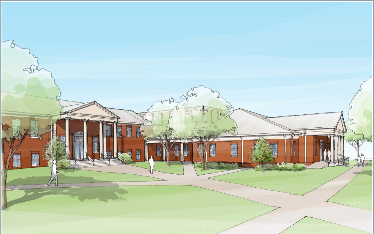
Fig. 4. Ford Hall Exterior with Media Center Addition