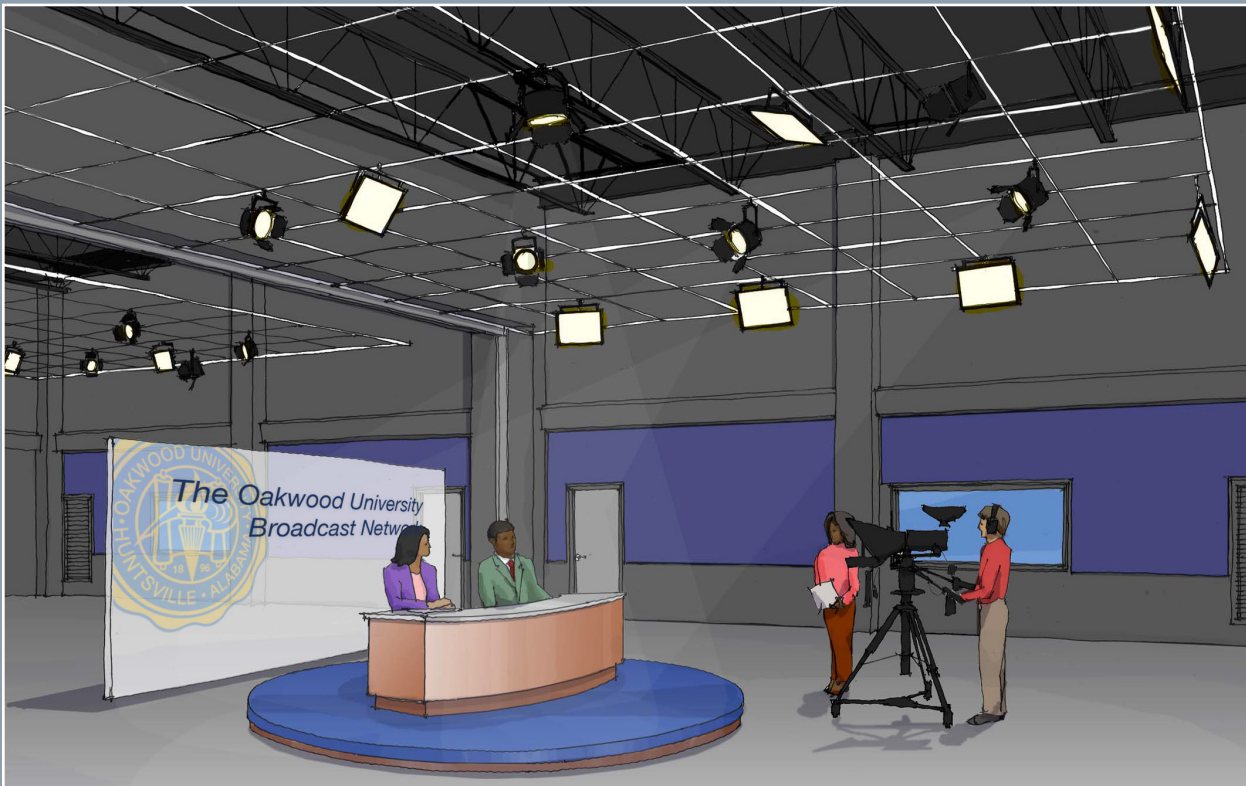
Fig. 5. Media Center Broadcasting Studio

Not only will the media center be a learning environment for our Communication students, but we plan to begin to tell our story by forming Oakwood University Broadcasting Network (OUBN). This Oakwood story of God-ordained ministry is something that needs to be spread to the corners of the Earth. We believe that this is the first step in blanketing the gospel message to places that others cannot reach.