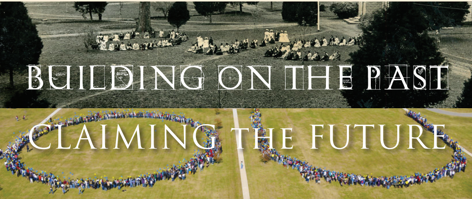
An Oakwood University Capital Campaign