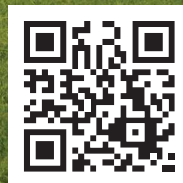
SCHOOL OF EDUCATION & SOCIAL SCIENCES