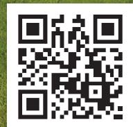
SCHOOL OF RELIGION