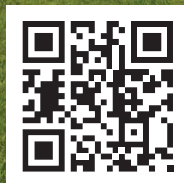
SCHOOL OF BUSINESS AND ADULT & CONTINUING EDUCATION